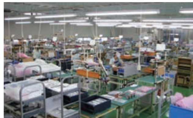
Shiga Factory (Inverter manufacturing workshop)