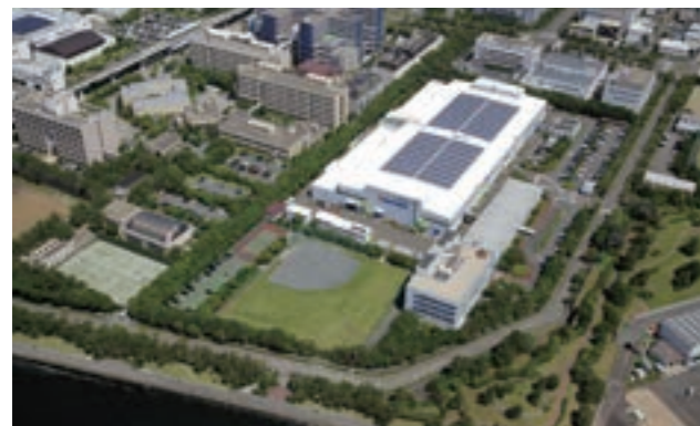
Yokohama Plant (aerial photo)

To respond to an anticipated expansion of orders in the future, we will expand production capabilities of the Yokohama Plant, which is the main production base for the Transportation Systems segment, and newly establish a factory and consolidate functions in the Shiga region, which is responsible for production of the Industrial Systems segment, in order to establish a structure to support net sales of 50.0 billion yen.