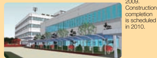
Artist's rendition of the finished building

At a meeting of its Board of Directors held on October 10, 2007, Toyo Denki approved specific capital expenditures with the aim of expanding production capacity as well as the Company's development and design capabilities at its Yokohama Works. Plans call for the construction of a new building adjacent to the existing works and office facility at an estimated cost exceeding two billion yen. A groundbreaking ceremony for the research, development and design building was held within the Yokohama Works site on January 22,