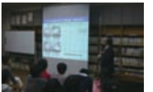
Students listening attentively to the slide presentation