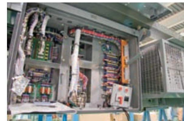
A VVVF Inverter

Regulated by a driver-operated master controller, electric devices such as traction control equipment play an important role in regulating the acceleration and deceleration of trains by controlling motor rotational speed. In conjunction with advances in the field of electronics, the shift from a resistance control to the chopper control system, and the rapid progress culminating in the development of a variable voltage variable frequency (VVVF) inverter, this control mechanism has contributed significantly to eliminating commutation, a major weakness in motors.