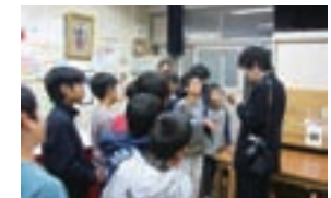
A reporter from the newspaper publishing company gathering material

These field lectures on the environment were also reported by the local newspaper. Looking ahead, Toyo Denki will utilize the information gathered in the natural course of its business activities to enhance the efficacy of its CSR activities.