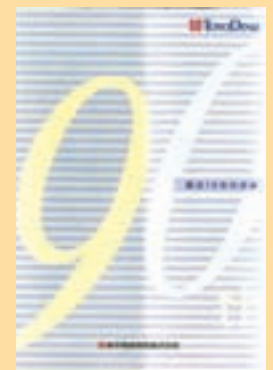
The 15-Year History

Toyo Denki celebrated its 90th year since foundation on June 20, 2008. While the Company published a 75-year history to commemorate its anniversary in 1993, a second publication tracing Toyo Denki's steps over the last 15 years was published to mark this recent milestone.