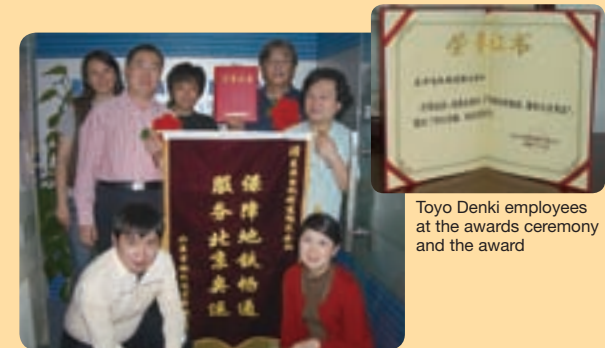
Toyo Denki employees at the awards ceremony and the award

systems for rail vehicles, the Company will contribute to the development of urban transportation in China.